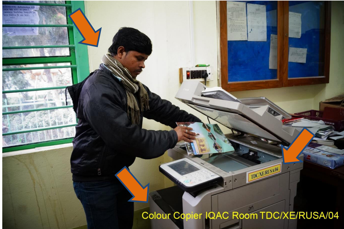
Colour Copier IQAC Room TDC/XE/RUSA/04