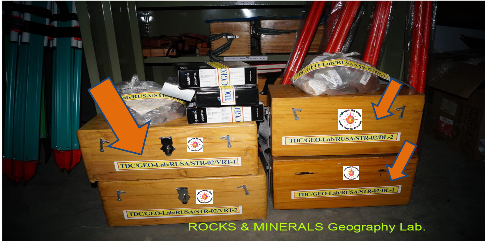
ROCKS & MINERALS Geography Lab.