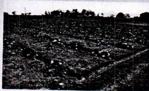
Drainage and Watershed boundary map shown on satellite imagery along with field photographs